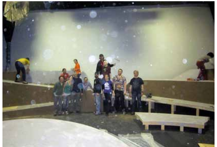
LEA members building the stage at Storybook Theatre