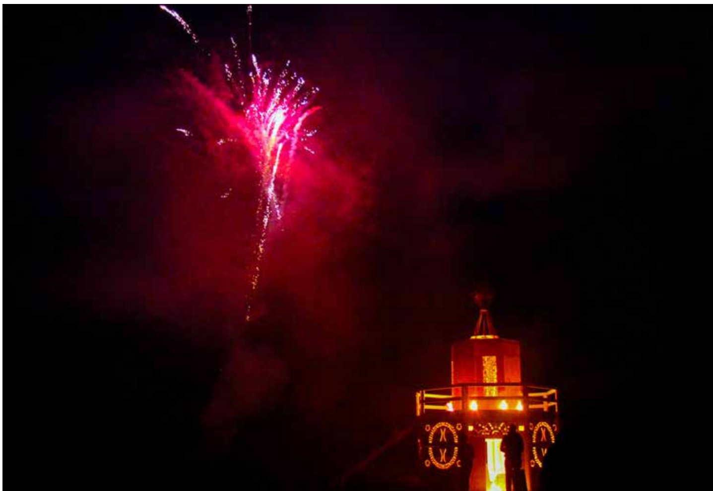
Man burn at Freezer Burn 2015