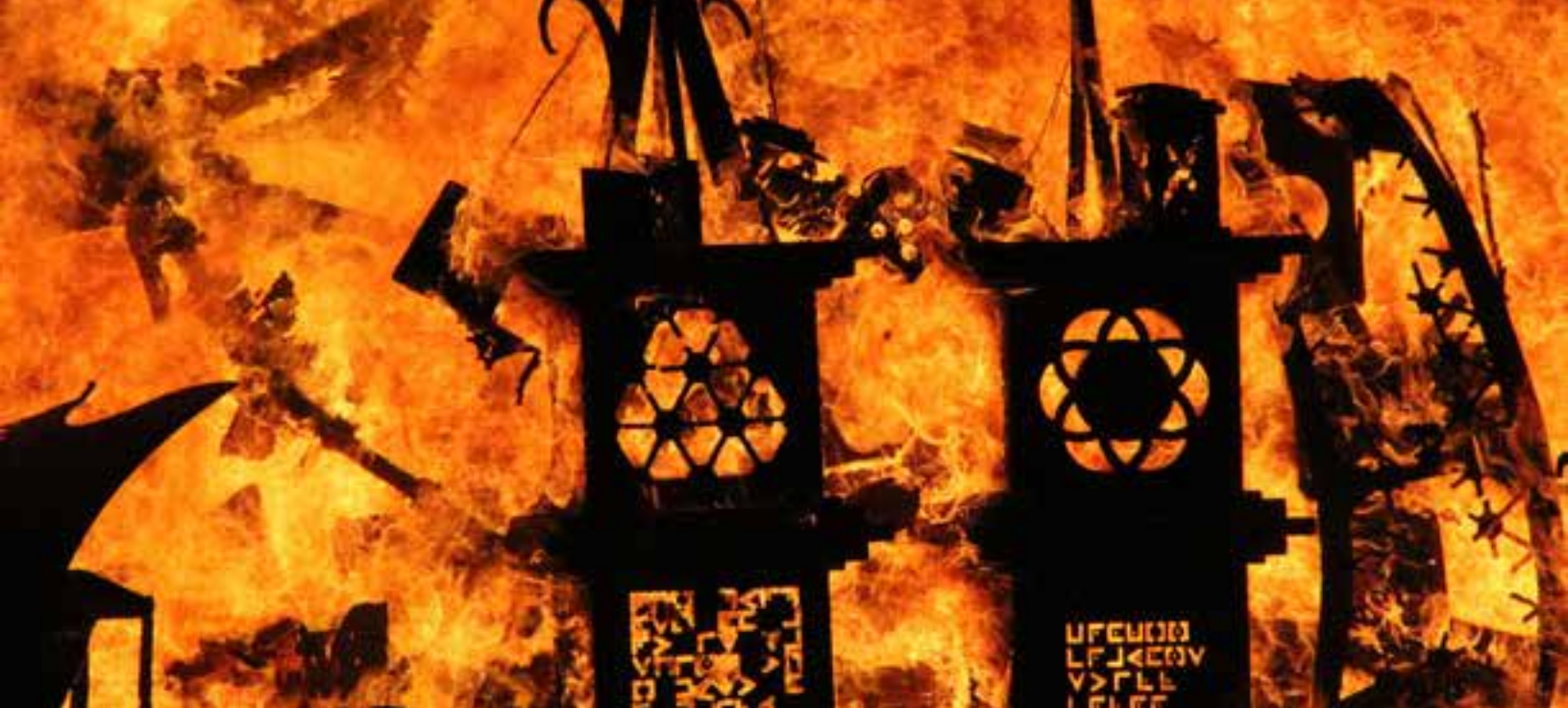
Temple burn at Freezer Burn 2015